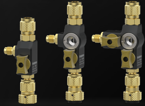
Valve Core Removal Tools VC1, VC1G, VC2G