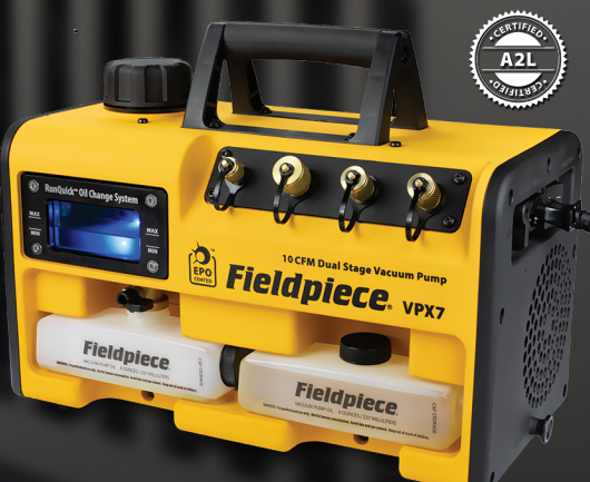
Vacuum Pumps VPX7, VP87, VP67