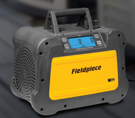
Recovery Machine MR45