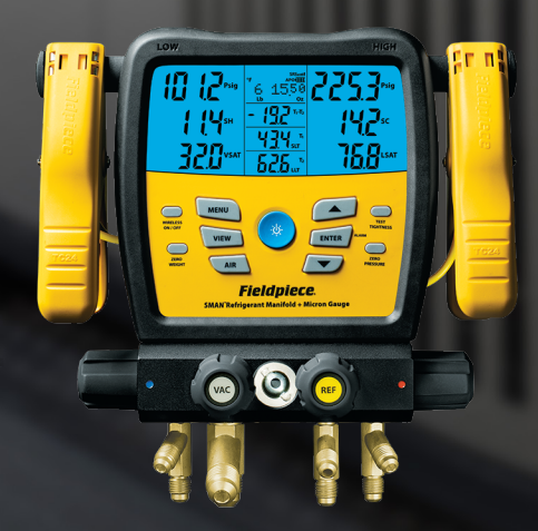
Refrigerant Manifolds SM480V, SM380V