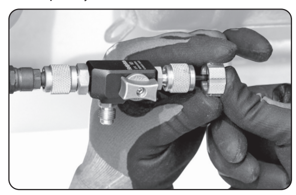
WARNING: Ensure the system fitting doesn't turn. If loosened, there is a risk of refrigerant to leak out.