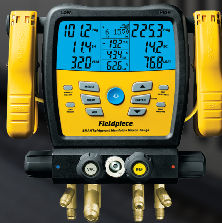
Refrigerant Manifolds SM480V, SM380V