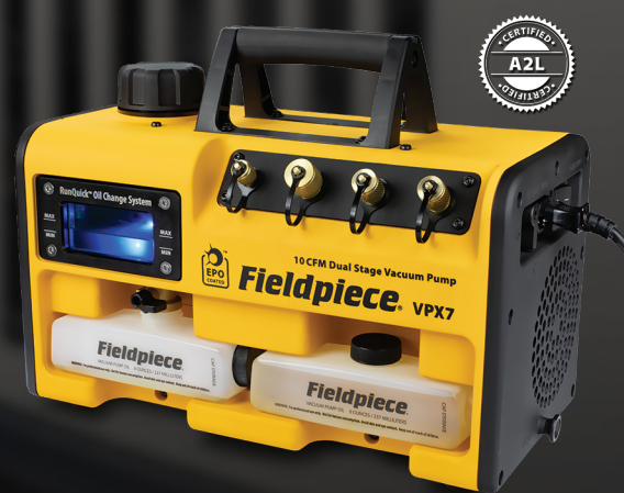
Vacuum Pumps VPX7, VP87, VP67