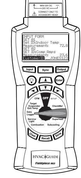
HVAC Guide® System Analyzer Model HG3